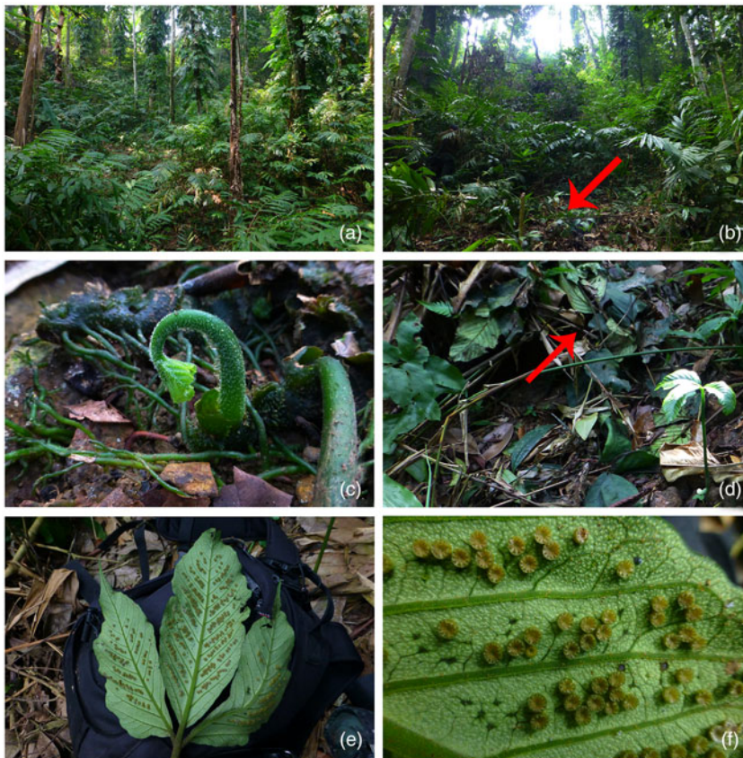
PLATE 1 Christensenia aesculifolia , showing (a) its natural habitat, (b) habitat destruction, (c) bud, (d) destruction of individual plants, and (e) and (f) plants cut down by farmers, showing spores.

from plants already cut down by farmers. In November 2017 we collected mature spores and several young shoots from living wild plants for breeding and cultivation at Kunming Botanical Garden; germination trials are ongoing. As of November 2017 the rhizomes of the 10 plants located in the wild are all growing.