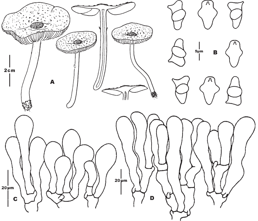
FIG. 2 Lepiota cristata var. macrospora : A. Basidiomata. B. Basidiospores. C. Cheilocystidia. D. Pileus covering. (A from HKAS 35988, B–D from HKAS 51356)